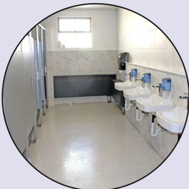
2023 Updated West Wing Bathrooms; New Sound System