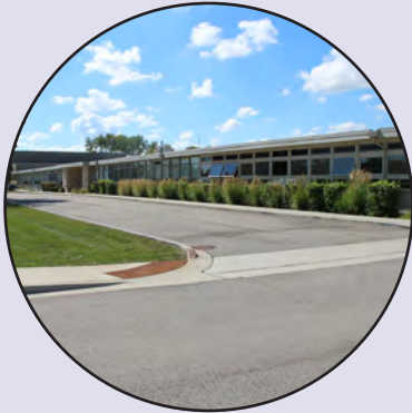
2021 New Front Drive