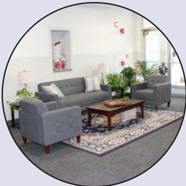
2022 New Front Lobby and Offices; Updated Flooring & Lighting